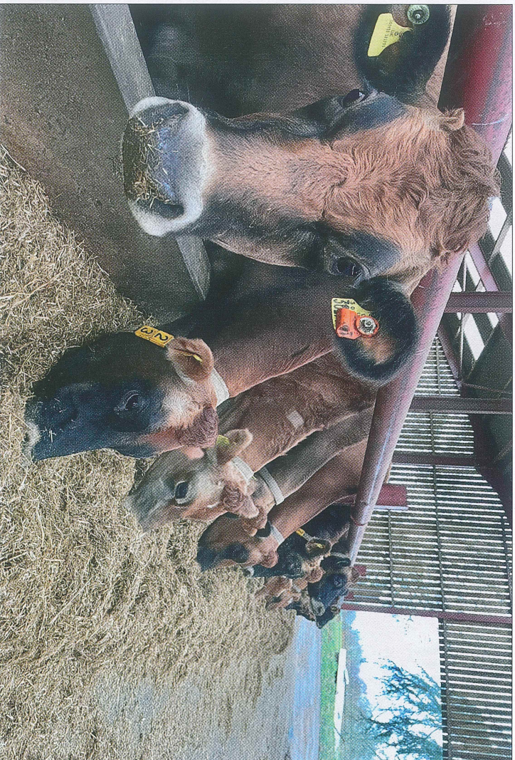
Health problems at Berrwick Home Farm have been picked up early by the new cow monitoring system.

Target yield has recently been reset to 7,800 litres.